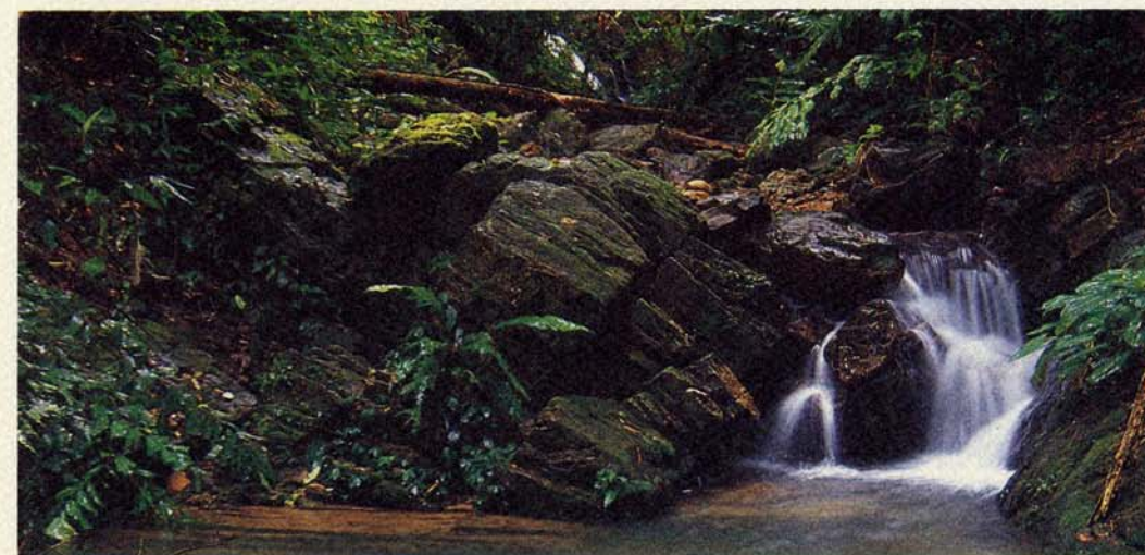
The tropical moist forest: Generally considered to contain the greatest diversity of biological species. Occupying only 7 per cent of the world's land area, it is the source of more than half the world's species

Second, since the 'agricultural revolution' and the 'industrial revolution' took place in the developed countries long before they took place or are taking place in the developing world, most of the forest destruction has occurred in the developed countries. Although Europe has an estimated 32 per cent of forest cover, virtually all of its primary forest has been destroyed. In the 'New World', the United States has a coverage of 21 per cent, but only