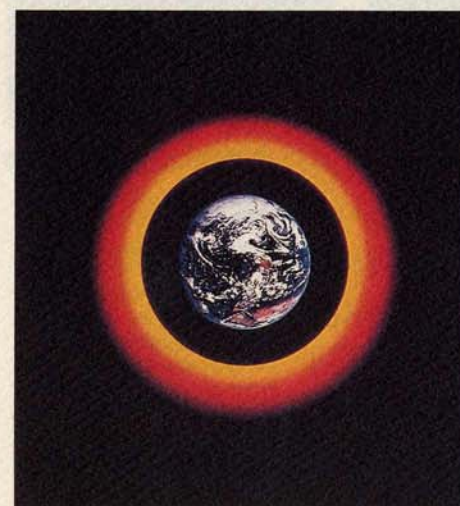
Global warming: It is clear that those countries which have vast tracts of forest are providing a service to mankind as a whole and to those countries that do not. They are supplying a public good for which they receive no recognition or benefit

First, the state of knowledge on global warming is in many ways still in its infancy. The simulations and modelling so far