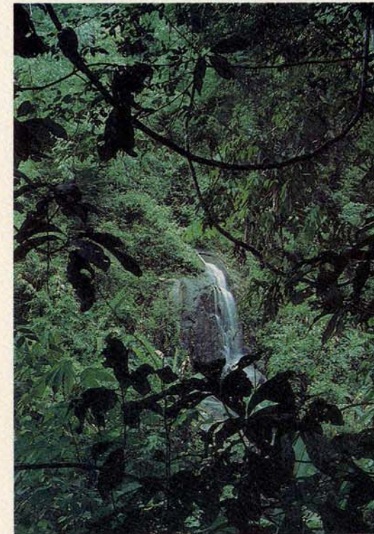
Towards the Greening of the World: As a contribution to the global commons, Malaysia is ready to pledge itself to a minimum 50 per cent level of forest and tree cover in perpetuity

A third source of funding could be generated on the basis of 'carbon balance accounting'. Consonant with the principle of jus-