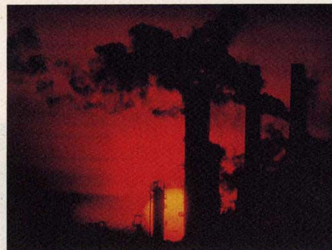
Development and the environment: The United Nations Conference on Environment and Development (UNCED) must be an occasion for truth, for balance, for good sense, for realism and effective action

There are serious environmental problems that exist at the local level, that must be tackled at the local level. There are seri-